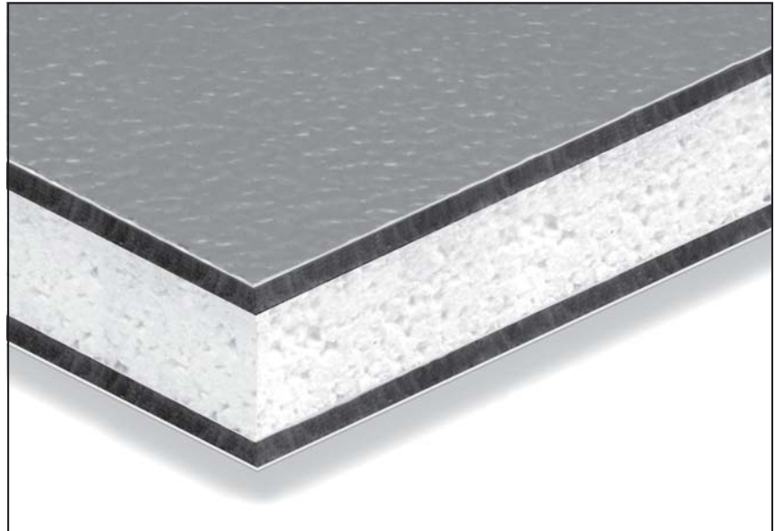
TABLE 1. COMPOSITION & MATERIALS

These panels are typically used on various types of buildings including schools and universities, retail complexes, storefront conditions etc... However, with an impact resistant composition and a foam core GlazeGuard ® 1000 panels are ideal for any other application where increased thermal properties, durability and safety are concerns.